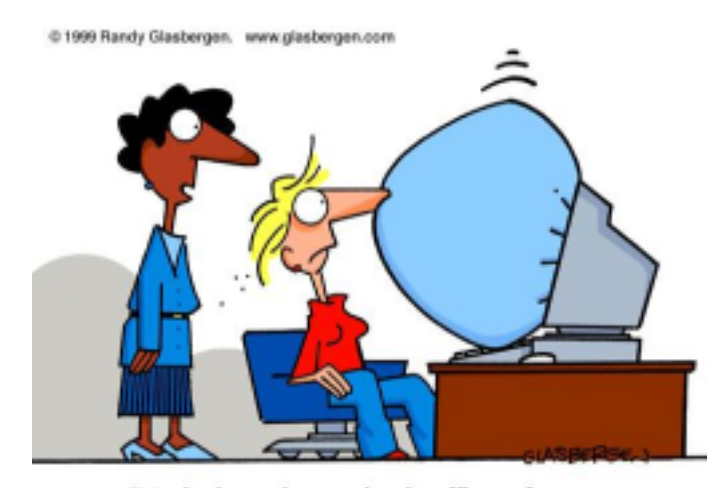
"It's the latest innovation in office safety. When your computer crashes, an air bag is activated so you won't bang your head in frustration."

Check it out. You will have a live forecast always available on your desktop.