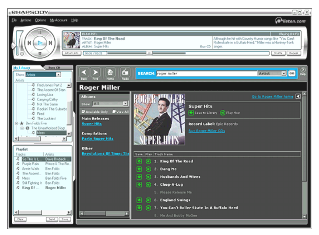
Rhapsody's interface is as flexible as it is good-looking. I also like the ability to be able to resize all parts of the window.

<u>Listen.com</u> Rhapsody is a music on demand service that gives you unlimited access to their entire catalog for $9.95 per month. You use their proprietary software to access the service, select the music you want to hear and play that music back. The service also offers the ability to burn individual tracks to CD for $.79 each, although not all tracks are available for burning