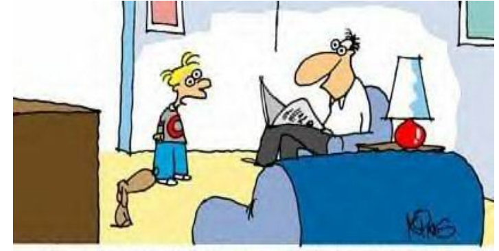
"I can't remember where I put all the information you had on your hard drive. However, a raise in my allowance might jar my memory."

We are always looking for letters, articles, reviews, news, tips, humor, cartoons, and art work for The News Journal. Items for publication should be made available to the Editor one month in advance (at the general meeting) or emailed to editor@lcace.org. We prefer straight ASCII text, with no left margin, unjustified right margin (sometimes called "ragged right"), no first line indent or outdent, NO TABS!, and a single carriage return between paragraphs. Believe it or not, the less formatting you do makes it easier on us! Special formatting instructions can be mixed in the text, enclosed in curly braces {}. An even better way is to mark up hard copy the way you want it and we'll endeavor to duplicate it.~